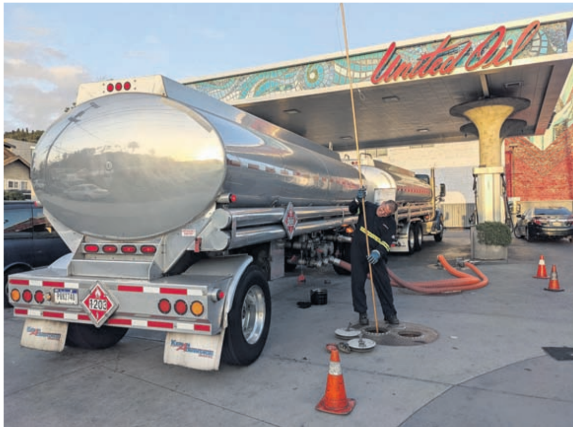
In this May 20, 2021 photo, a fuel truck driver checks the gasoline tank level at a United Oil gas station in Sunset Blvd., in Los Angeles.

The cartel decided to stay the course decided at earlier meetings to raise production by 2.1 million barrels per day from May to July. The group planned to add back 350,000 bar-